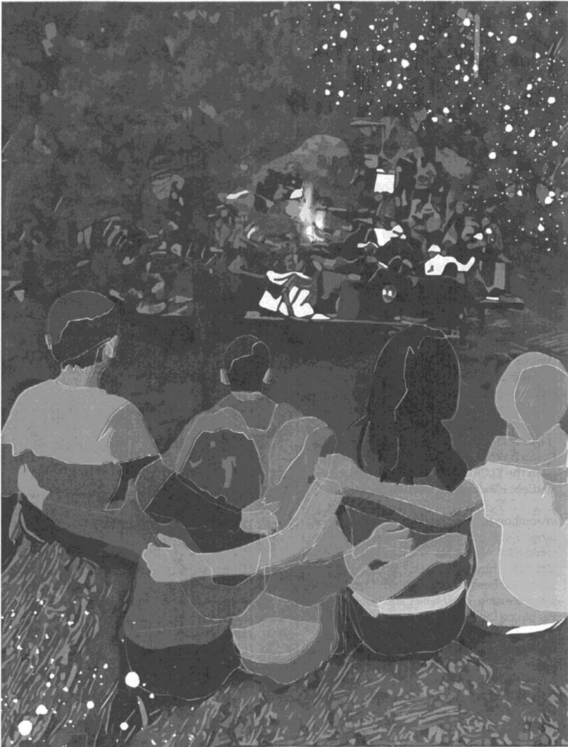
Outlaw Ranch's Connecting Cultures at Camp program brought together longtime camp families with new camp families from Pueblo de Dios, an ELCA congregation in Sioux Falls, S.D.