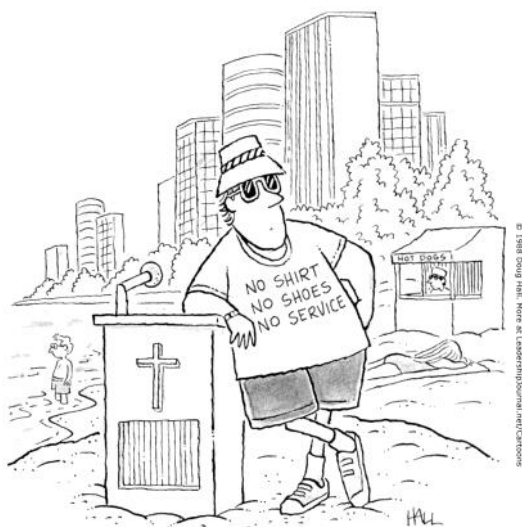
Eventually, Hank realized he was too rigid for beach ministry.

See the following pages for supply lists, these are estimates based on last year's supplies, an updated list has not been published at press time for our Sentinel – we will provide an update if there is a change but these are general basics they've used the past several years.