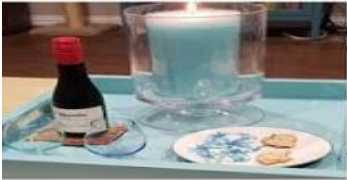
Central Lutheran Church Dallas, Tx