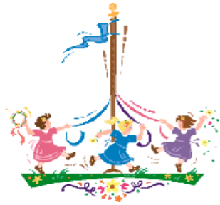
Does anyone remember dancing around the May pole?