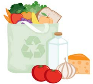
Your gifts the first Sunday of each month benefit White Rock Center of Hope and the Lutheran Home at Clifton, Texas, Central’s Mission Partners.

Needs: jelly, peanut butter, tomato products, mac ’n cheese; queen-size bedding; children’s shoes; men’s briefs, shoes and jeans.